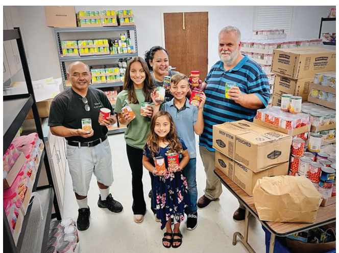
ONE IN FIVE PEOPLE LIVES IN POVERTY On average, 18% of the people in our missions live in poverty. Your gifts help meet the basic needs of many who are struggling.